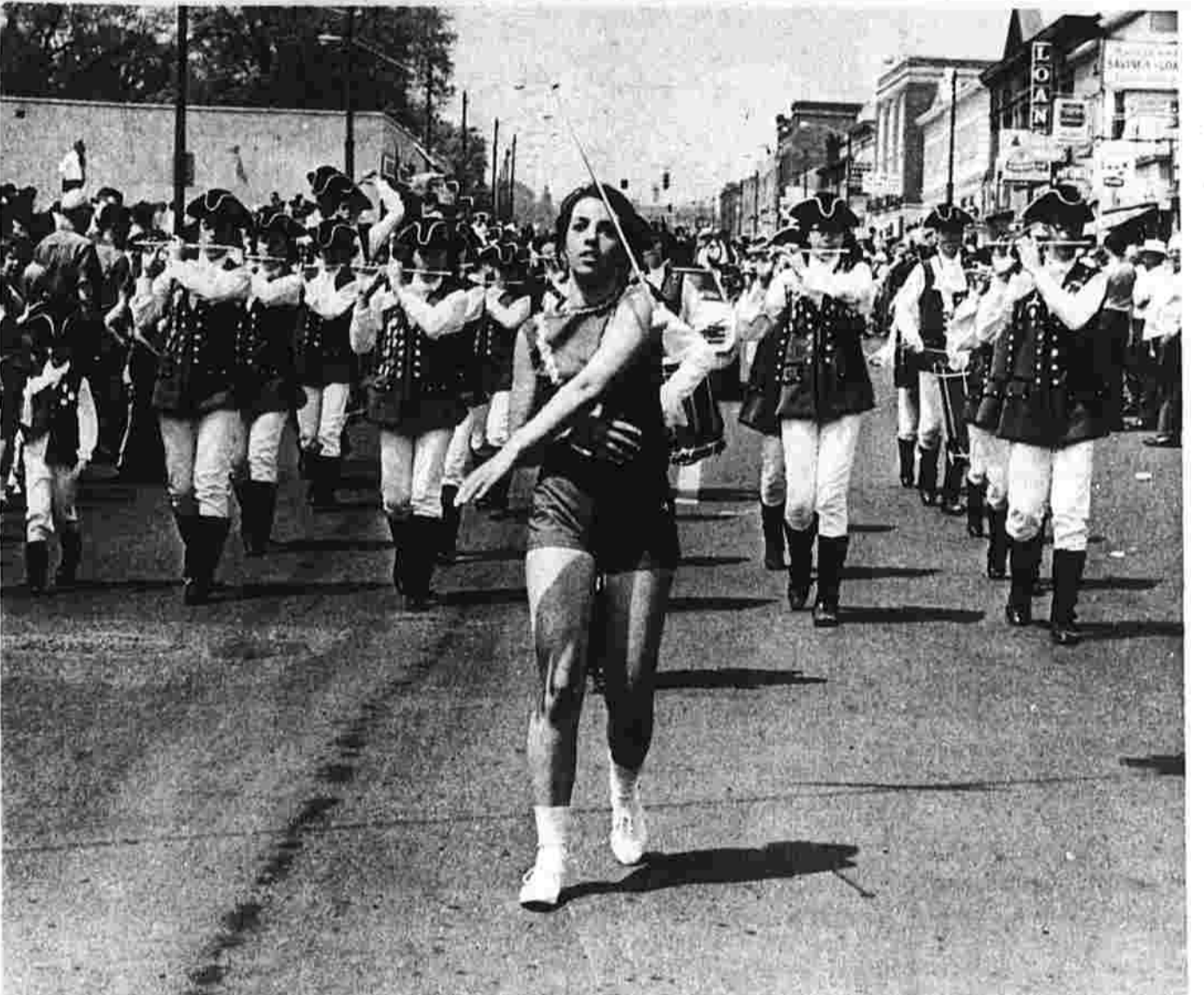
Manchester parades a tradition for Yalesville Junior Ancients. These are the Yalesville Junior Ancients, appearing during the 50th anniversary celebration of the Army and Navy Club on May 19, 1969, marching on lower Main St. at Forest St.

Area News 7 Dear Abby 13 Business 14 Editorial 4 Churches 5 Obituaries 6 Chevy Grids 6 Sports 8-9